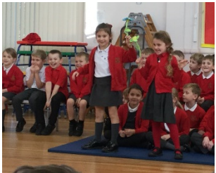
The Three Billy Goats Gruff...