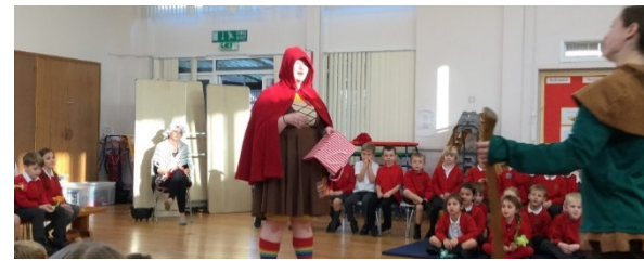
Little Red Riding Hood...