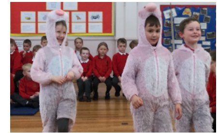
We role played the Three Little Pigs.